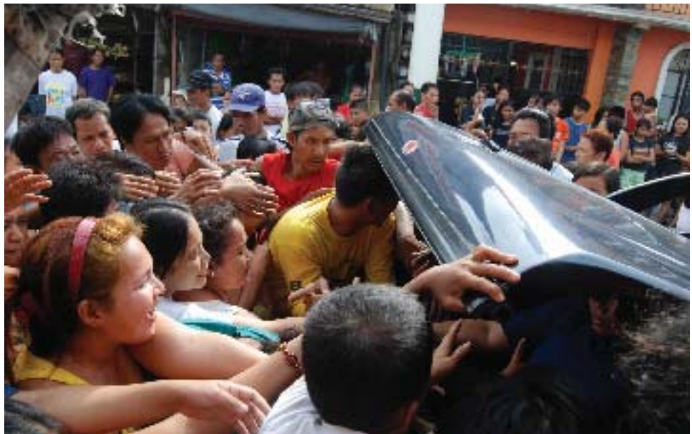
Typhoon victims rush to the open trunk of the volunteer's car bringing the relief goods.

This is the only dry area of this community. Few meters of the barangay interior is still submerged in water.