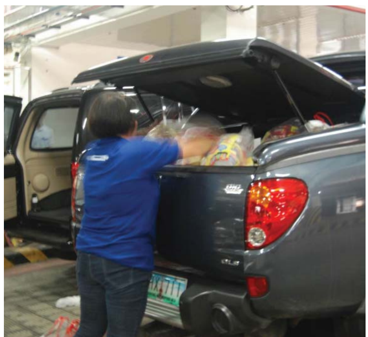
Loading of relief goods for 100 to 120 families