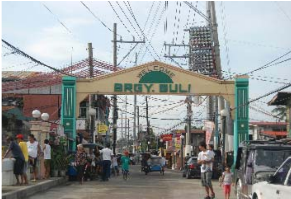
Barangay Buli, Muntinlupa City.

This is the only dry area of this community. Few meters of the barangay interior is still submerged in water.