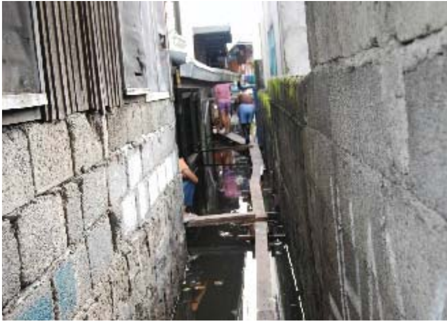
Foot bridge constructed for access in and out of the community interior of Bgy. Buli.