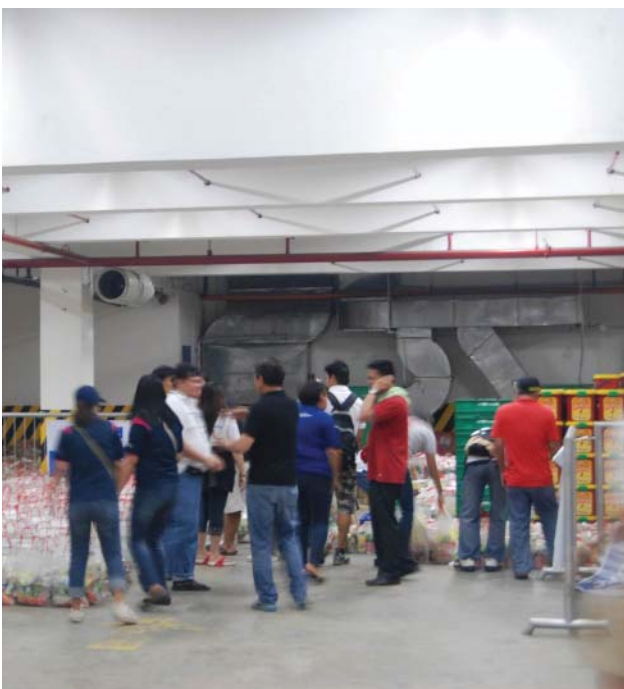
Relief goods & volunteers in Walter Mart